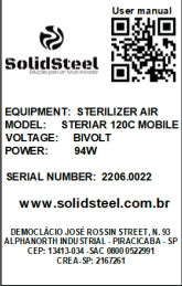
Label with serial number and model